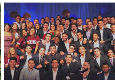
Florida International University Delta Zeta Chapter's Miss Fleur de Lis pageant.