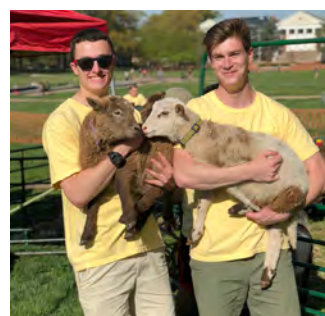
University of Arizona Beta Gamma Chapter's Sigma Alpha Zoo event.