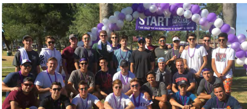
University of Arizona Beta Gamma Chapter at Walk to End Alzheimer's.

Beyond Walk, other autumn activities showcased members' creativity and signature spirit. SUNY Purchase's Epsilon Omicron Chapter hosted pumpkin carving during Jacks 4 Judo. University of California, San Diego took competitors to the beach for Sammy Sandcastles 2K17. Florida International University's Delta Zeta Chapter teamed up with their sorority peers on a fundraising pageant to crown the 2018 Miss Fleur de Lis. In addition, Sigma Alpha Mu's long-standing tradition of No Shave November — when participants forgo their razors for the cause — raised more than $16,000.