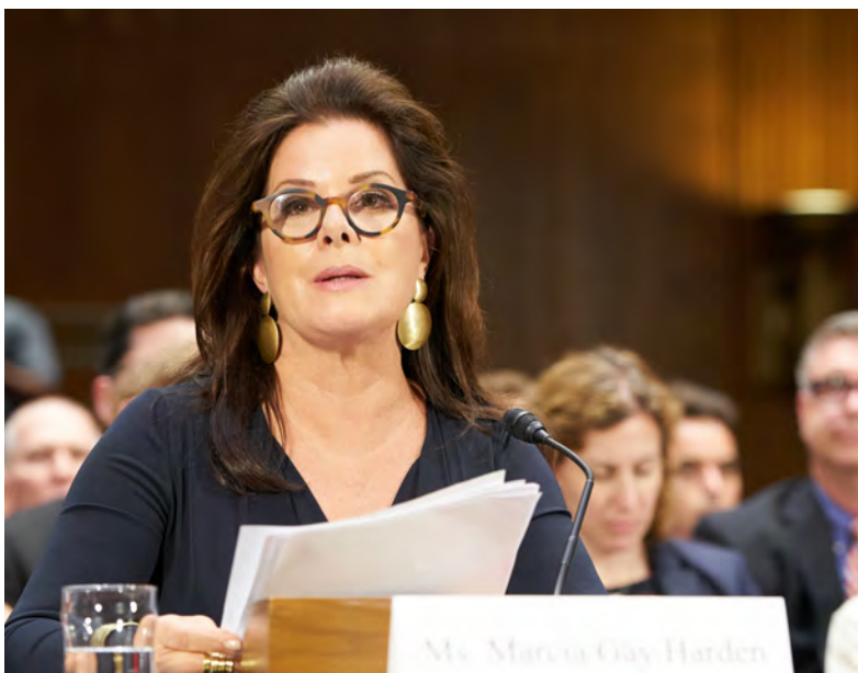
Academy and Tony Award-winning actress and Alzheimer’s Association Celebrity Champion Marcia Gay Harden testifies at the Senate hearing.