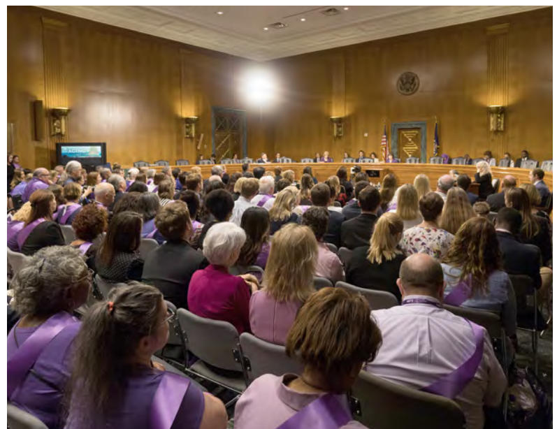
Ambassadors and advocates fill the room for the Senate Special Committee on Aging hearing.