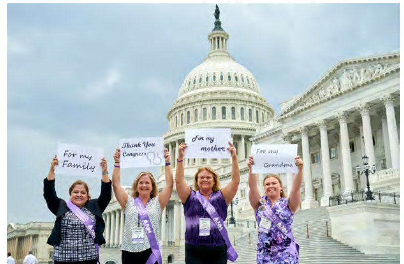
Ambassadors and advocates gather on Capitol Hill prior to meeting with their elected officials.

Ambassadors are playing a crucial role in creating momentum behind one of the Association's top legislative priorities, the Building Our Largest Dementia (BOLD) Infrastructure for Alzheimer's Act. This legislation would establish Alzheimer's Centers of Excellence nationwide to expand and promote the evidence base for effective Alzheimer's treatments, and issue funding to state and local public health departments to promote cognitive health, risk reduction, early detection and diagnosis, and the needs of caregivers. In addition, the BOLD Infrastructure for Alzheimer's Act would also increase collection, analysis and timely reporting of data on cognitive decline and caregiving to inform future public health actions.