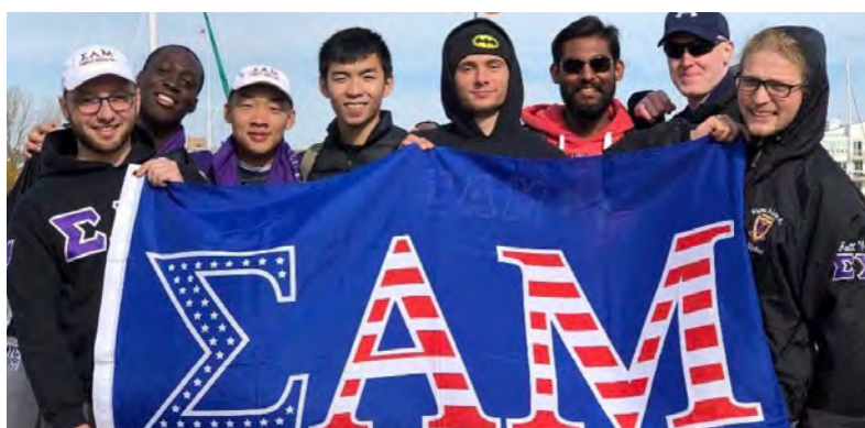
Brooklyn College Mu Upsilon Chapter at Walk.

Sammies maintained their incredible philanthropy efforts through the spring term. The University of Arizona's Beta Gamma Chapter organized a petting zoo fundraiser called Sigma Alpha Zoo, and Arizona State University's Gamma Phi Chapter served up a Sammy Sand Volleyball Tournament. The Epsilon Nu Chapter at the University of Connecticut hosted SAM JAM 2018, a KanJam (flying disc) tournament. The University of Minnesota's Kappa Chapter took top honors for the first-ever ΣAM March Madness Bracket Challenge.