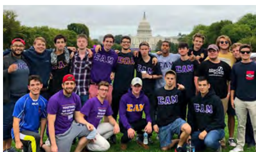
American University Delta Beta Chapter on Walk day.